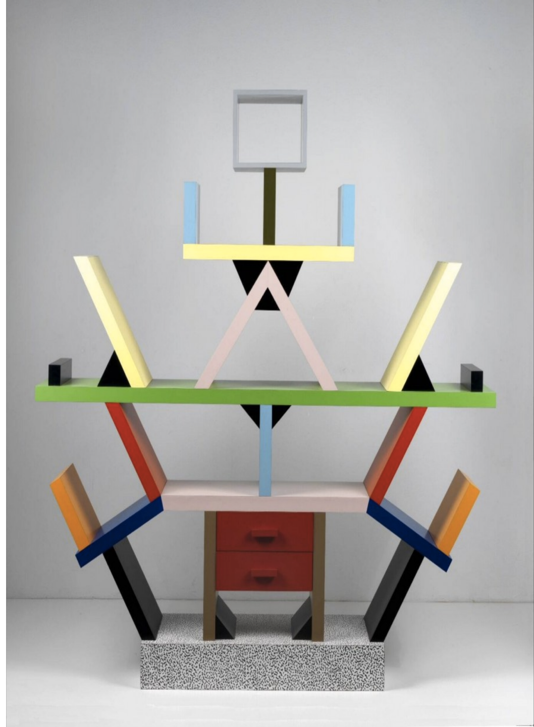
Ettore Sottsass, Memphis srl (1981)