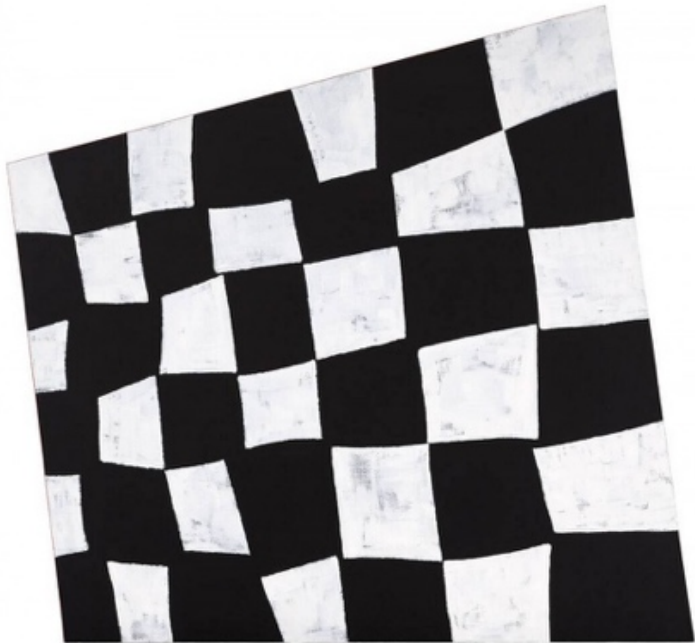
JCJ VanDerHeyden, Checkerboard, 1988