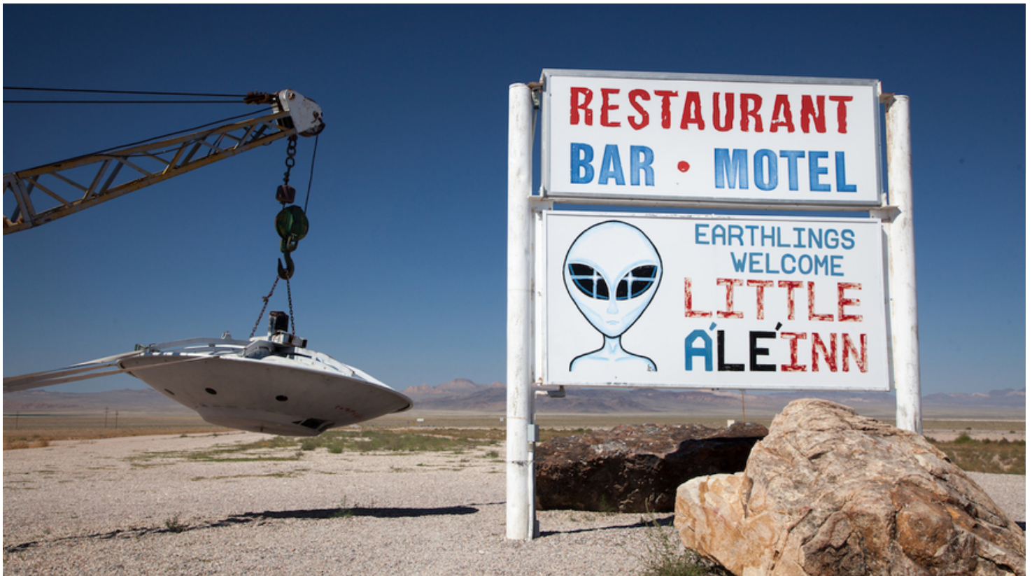
Image 1. The sign for the Little A'Le'Inn with a flying saucer hanging from a tow truck in Rachel, Nevada, near Area 51.

Right away, you can tell this is no ordinary diner. For starters, there's a grim-faced little green man holding a sign saying "Welcome Earthlings."