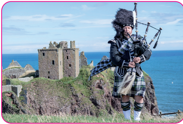
A man playing bagpipes