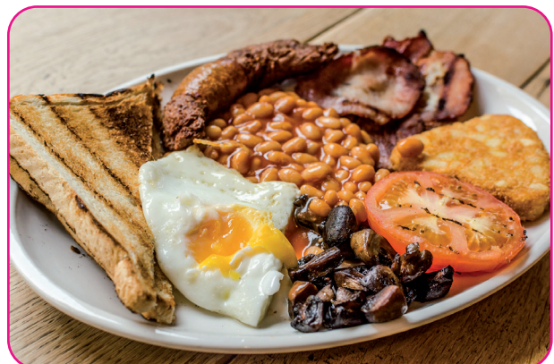
An English breakfast