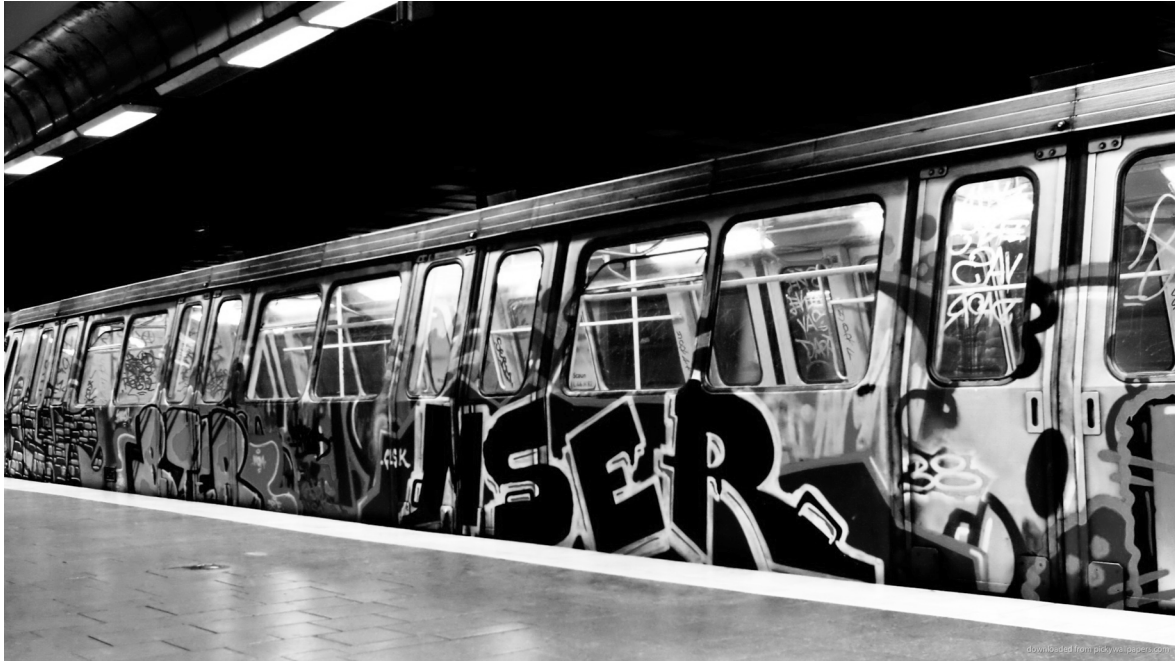
The Australian, 2012

a wider community service so we encourage the idea of a citizen within a society rather than confirming a sense of the heroic loner against the system.